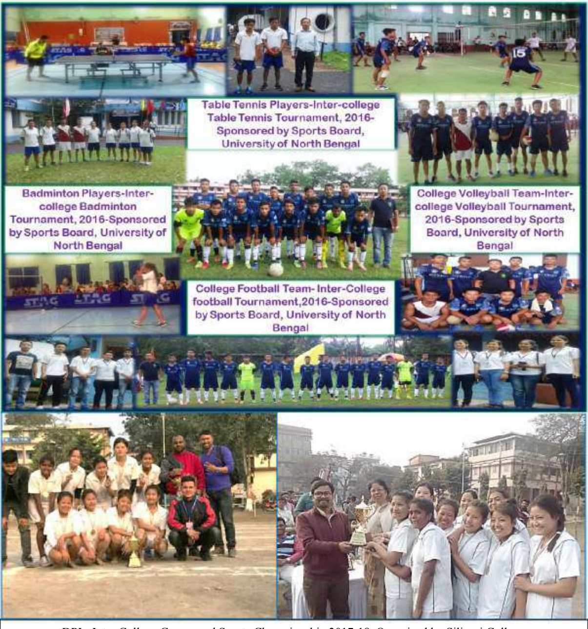
DPI - Inter College Games and Sports Championship 2017-18, Organized by Siliguri College